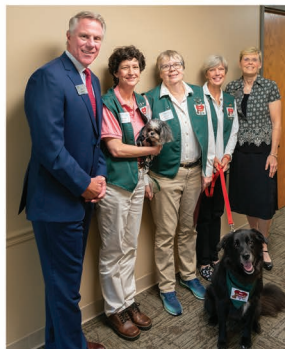
HELPING HANDS AWARD New Friends Great and Small