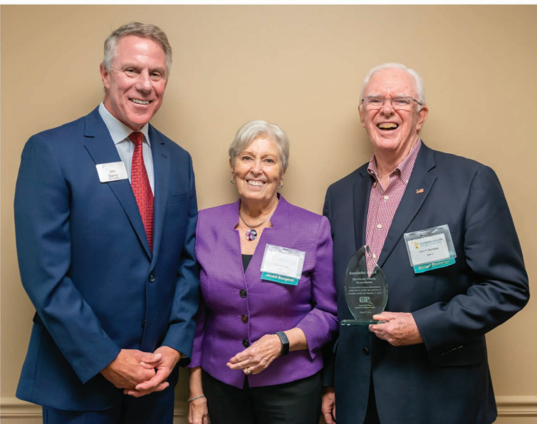
BENEFACTOR AWARD Morrissey Family Businesses