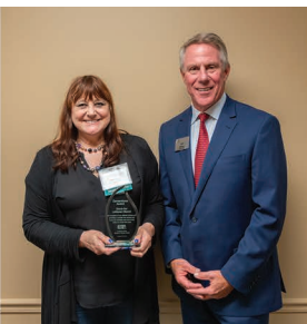
CORNERSTONE AWARD Gloria Dei Lutheran Church