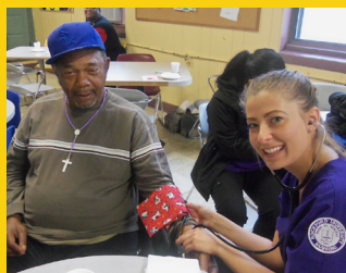
Blood Pressure Checks